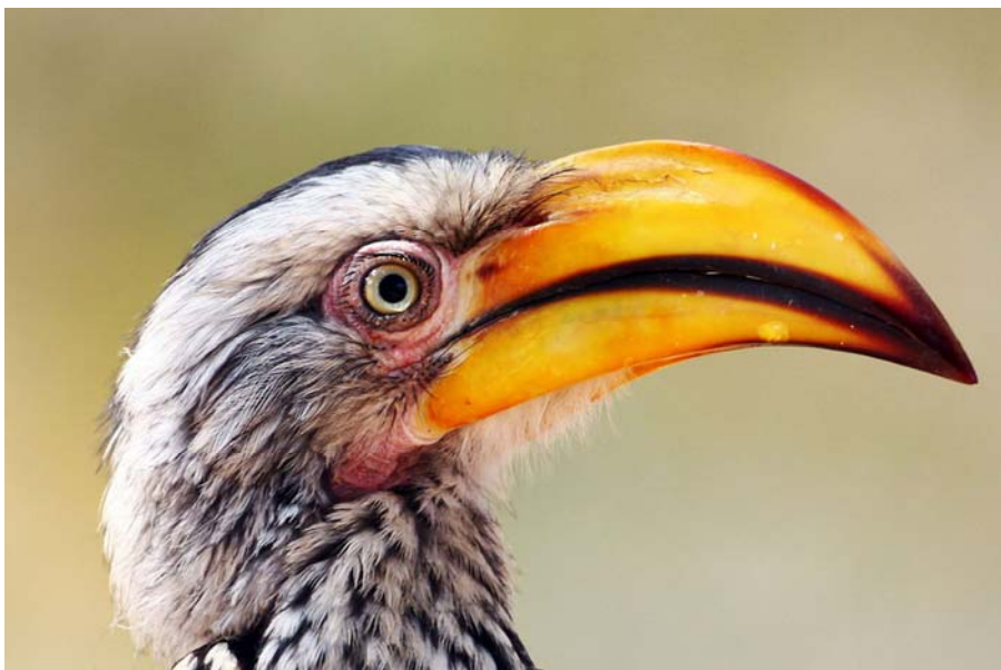
Southern Yellow-billed Hornbill taken by Larry Kay, September, 2009 in the Damara-land desert near Twyfelfontein, Namibia, at the Aba Haub rest camp.