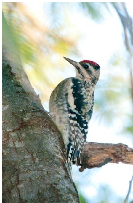
Yellow-bellied Sapsucker, December 3, 2009, 3:11 PM, at the intersection of Arbor Rd. and Creek Dr. in Menlo Park, CA