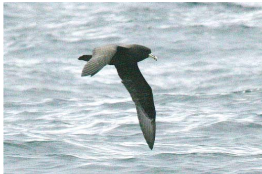
White-chinned Petrel Oct. 18, 2009 SAS HMB Pelagic Trip.

Stay tuned for information about any Sequoia Audubon Society trips, as well as trips from other providers, by regularly checking the Sequoia Audubon Society homepage. You will also find a gallery of pictures of the White-chinned Petrel at that webpage: http://www.sequoia-audubon.org/home.html .